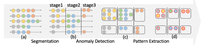
Figure 1: The visual anomaly detection of learning sequence data.

R1. Consider the entire learning sequence. Our goal is to allow